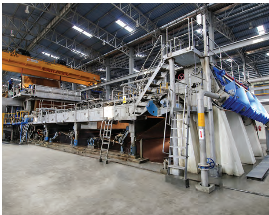
Wet end of PM 6