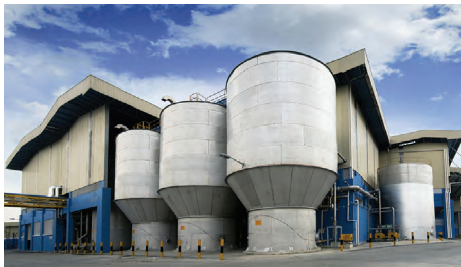
PM 6 machine building- storage towers (foreground)

the paper mills. Recently there have been occasions when the mill encountered a temporary shortage of waste paper collection domestically. To overcome this, Muda Paper has no choice but to resort to importing wastepaper from countries from as far as Japan, Australia, New Zealand, United Kingdom, Denmark and Sweden.