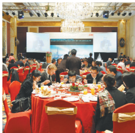
The gala welcoming dinner for guests and dignitaries.

Our new Shanghai factory demonstrates ABB's long-term commitment to the worldwide pulp and paper industry – and is compelling proof of the "Made by ABB" concept.