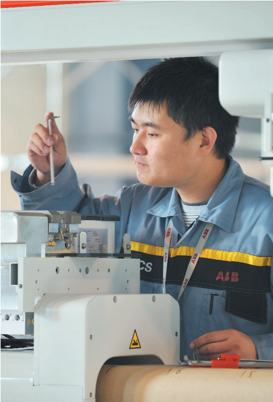
ABB runs a wide variety of programs that support education, environmental issues and charitable causes. ABB provides scholarship assistance to needy Chinese university students that helps them fulfill their dreams. The company has also worked with vocational schools in Xiamen and Chongqing to set up “ABB Classes” that help students develop their skills.

In keeping with ABB’s commitment to the environment, ABB supports many environmental protection campaigns in China. One of the most important is ABB’s efforts with a key customer, Inner Mongolia Power Company, to fight against desertification in Ordos, a city in China’s north Inner Mongolia Autonomous Region.