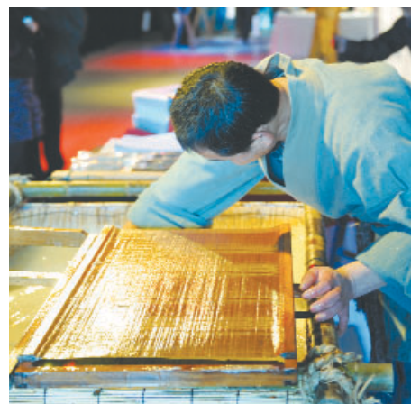
The ancient Chinese art of papermaking demonstration.