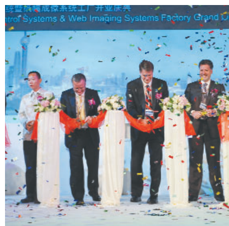
The ribbon cutting ceremony that made the new facility "officially" open for business.