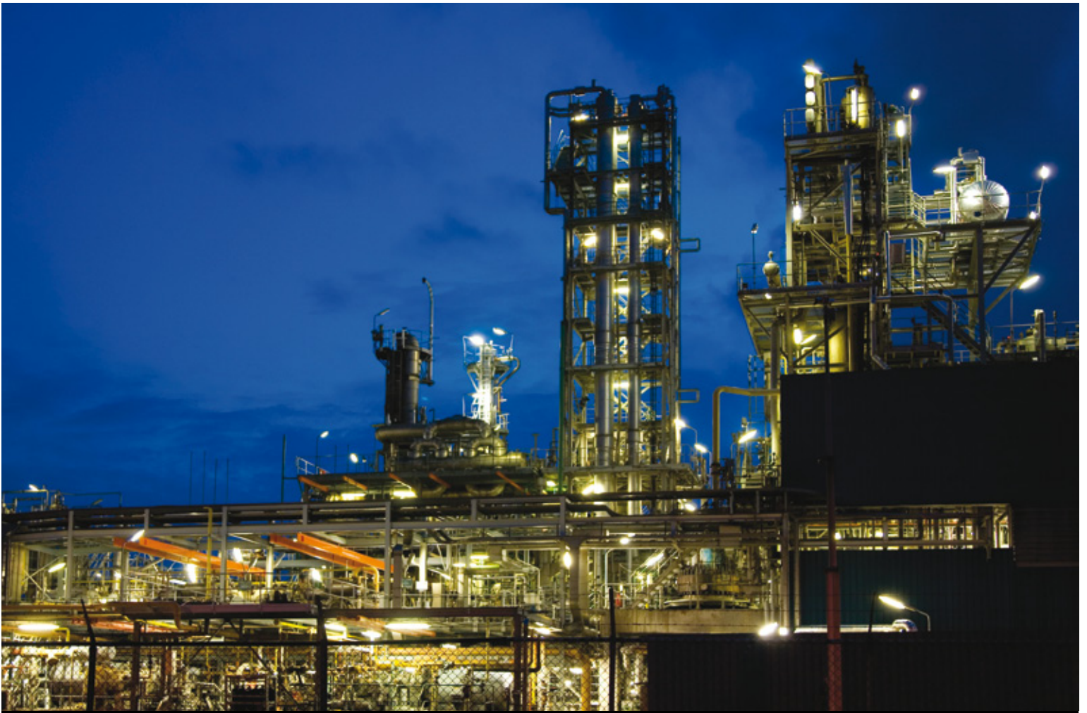
ABB in the Chemical and Petrochemical Industries