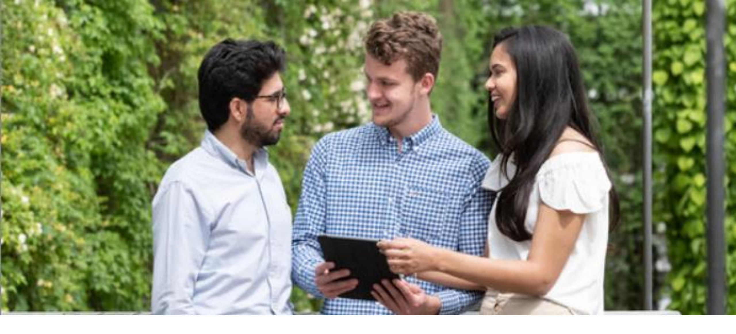
Qs on accessing the all new ABB Control Systems Channel Partner Portal?