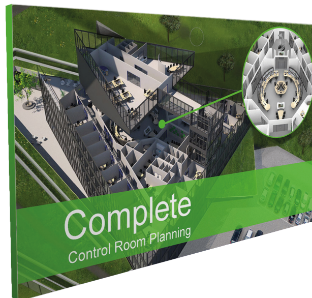
ABB Control Room Pre-studies can today be made in three different levels of involvement: Review, Design and Complete. The packages differ in terms of design depth for a perfect fit of the control room needs and requirements. This document describes the “Complete” design depth.

By conducting an ABB control room pre-study, you get the unique possibility to create a control room environment that perfectly suits your needs and individual situation. The pre-study focuses on human factors interacting with 800xA.