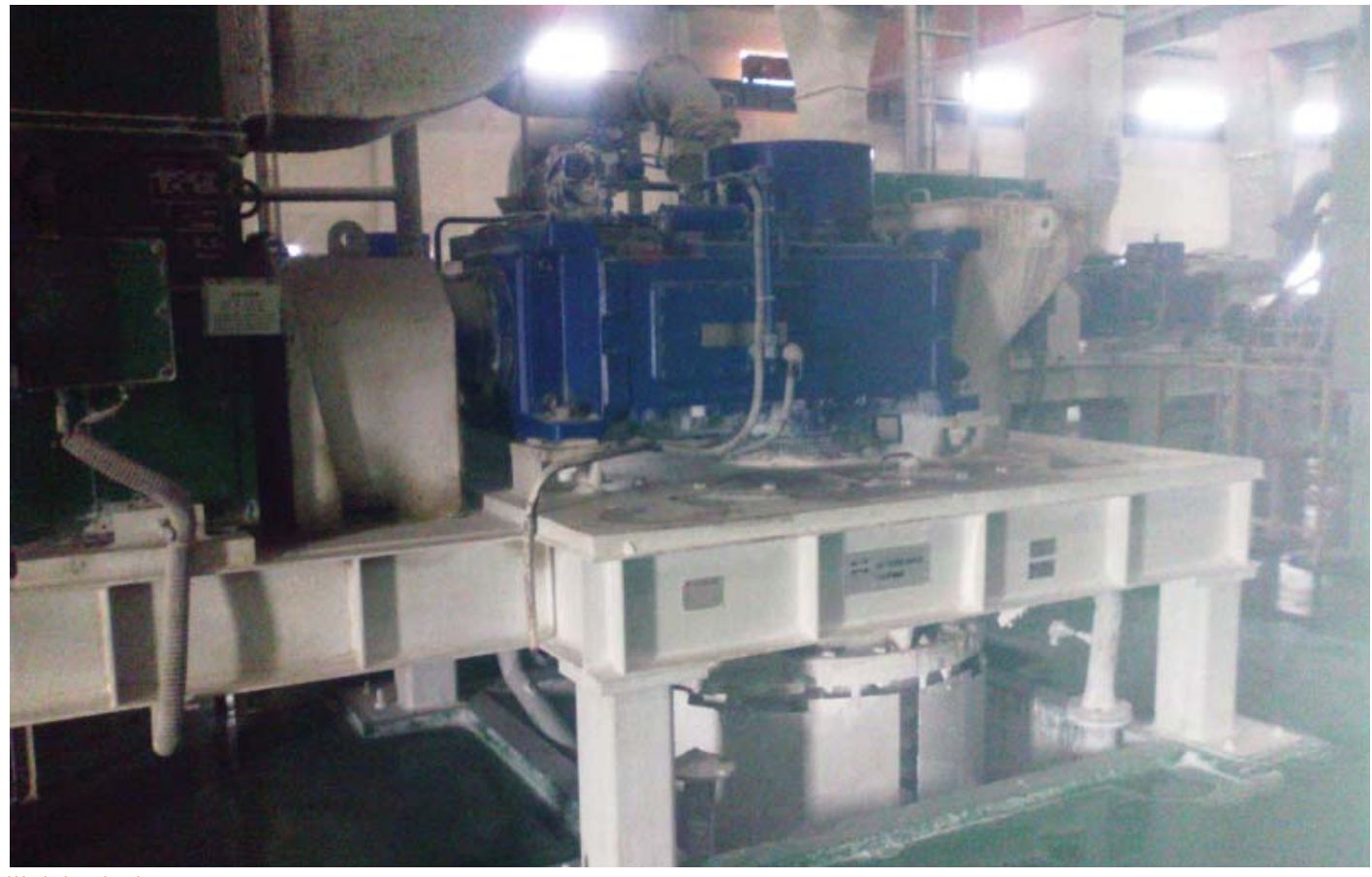
Workshop in plant