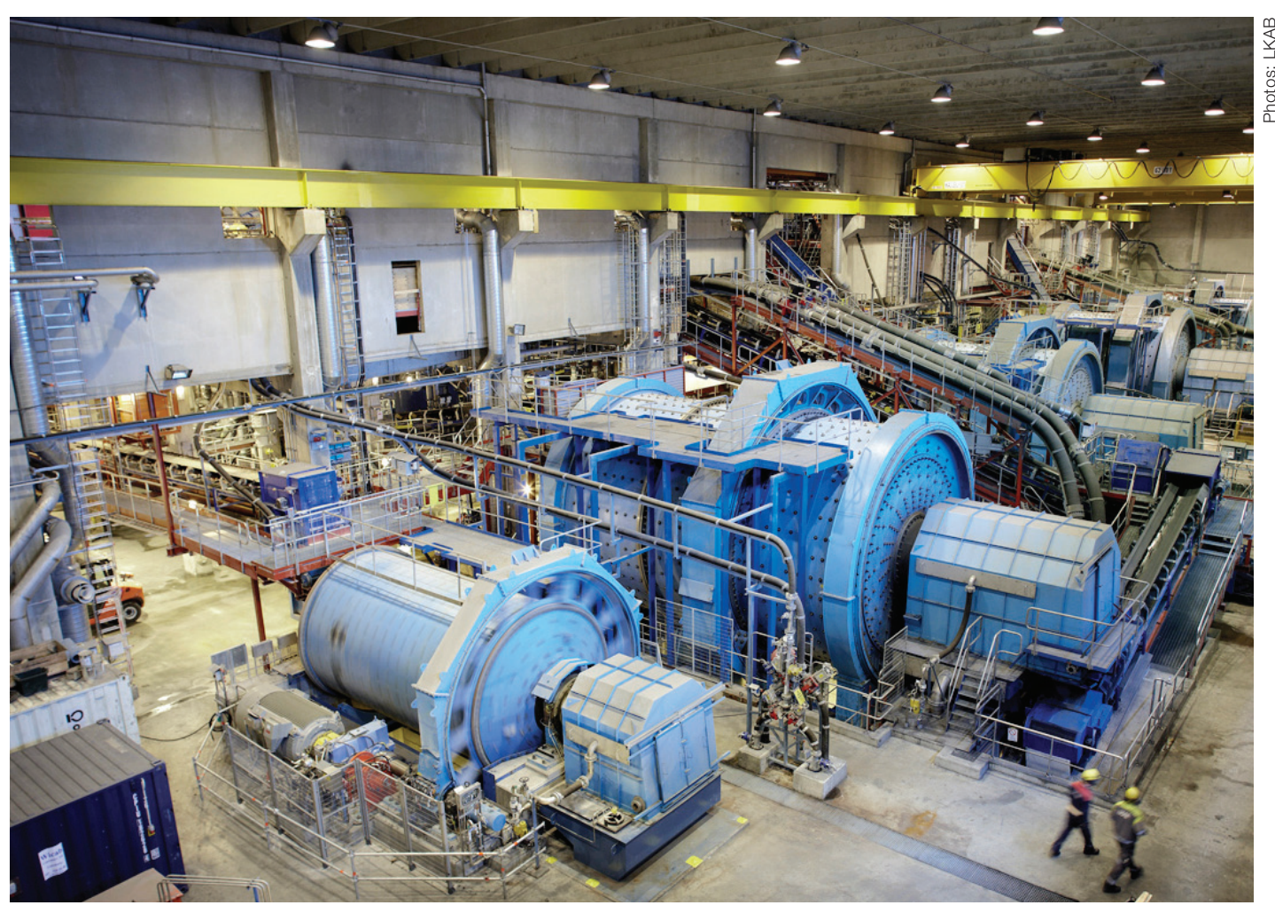
The new processing and pelletizing plant is an enormous facility with the capacity to produce five million tons of pellets each year.