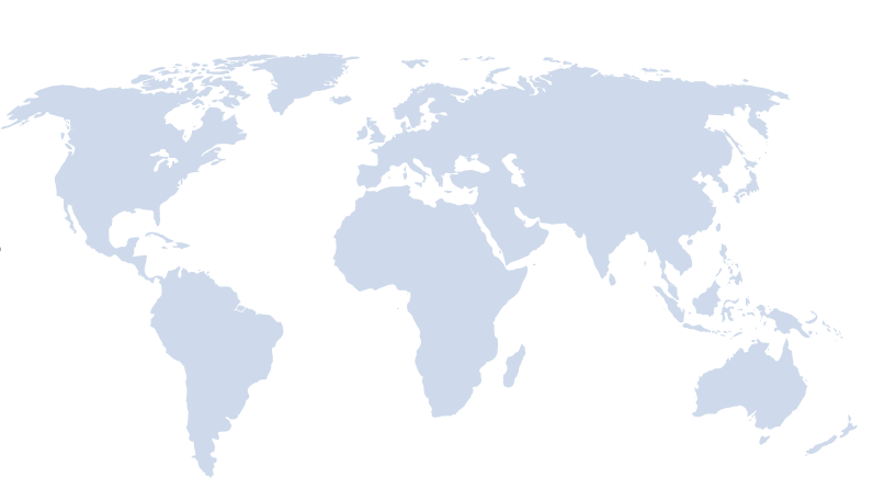
ABB drives channel partner categories

The customer will always have access to ABB MV drive's complete service offerings, which will be provided by ABB or ABB's channel partners. The fulfillment of these offerings is backed by professional ABB training and advanced tools.