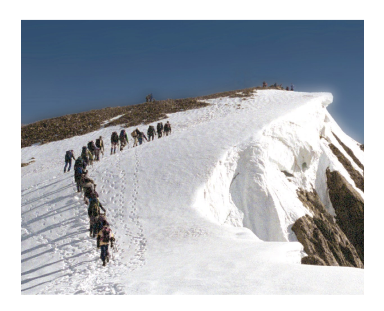
ABB medium voltage drives from authorized partners