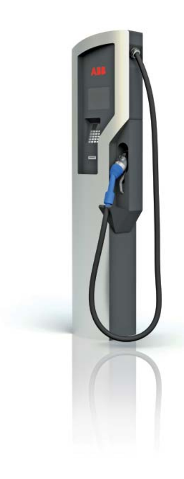
ABB DC fast charge stations will allow rapid recharging of electric vehicles. Depending on the battery and vehicle type, recharged range of greater than 100km in less than 10min is readily achievable. As battery technology advances further, recharging will become available with the speed and simplicity of a fuel stop.

ABB Power Electronics moves to deliver advanced offboard vehicle charging solution. High power for rapid recharging, enabling long distance travel and eliminating range anxiety.