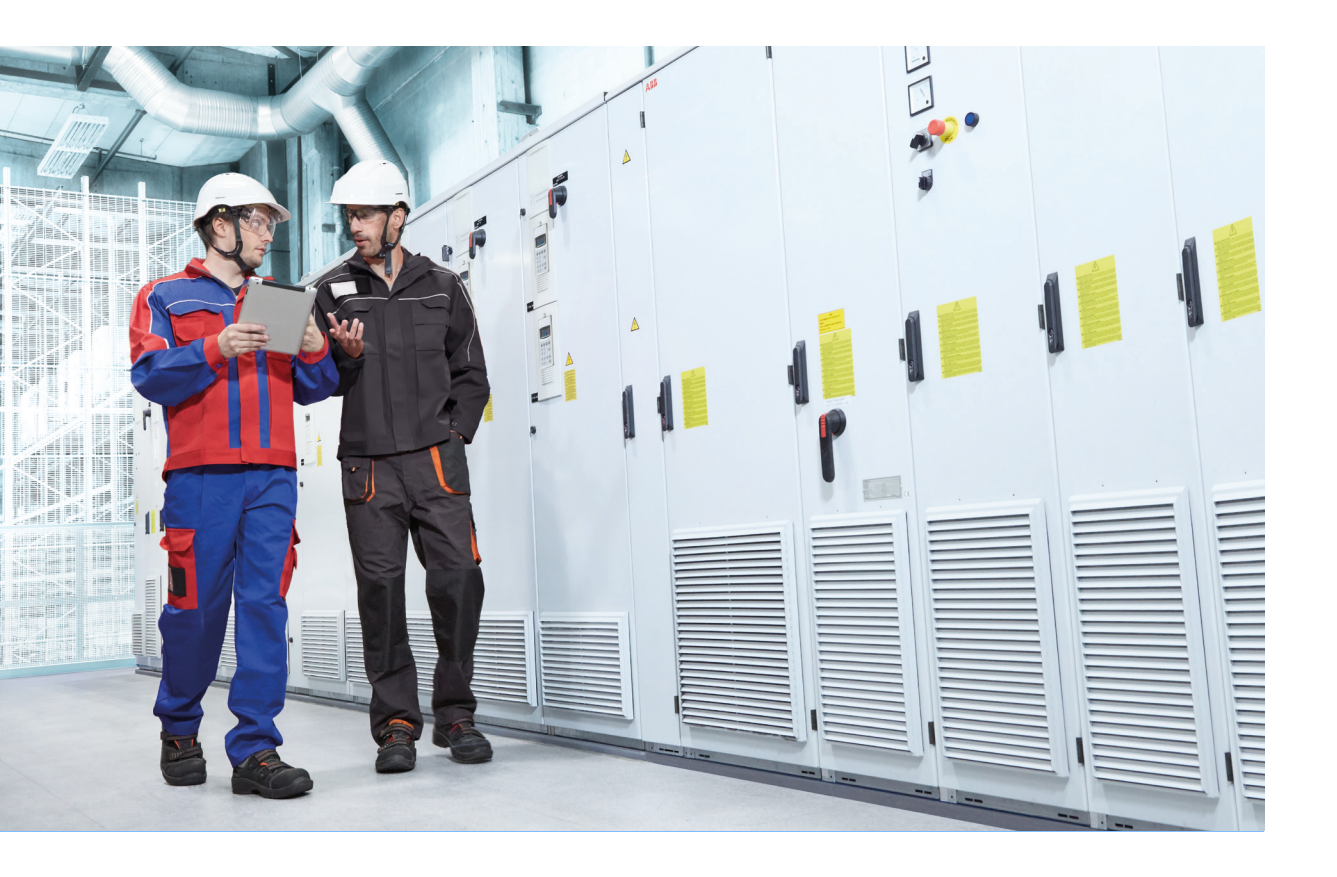
ABB DRIVE SERVICES