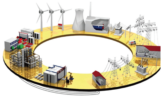
Fig.1 Future Grid

renewable generation units and storages connected to the consumer point. The same customer may act both as a power producer and a consumer. This requires bi-directional power flow capability in the supply network connection point and in the other parts of the supply network, too.