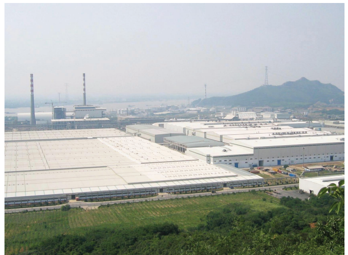
APP, Gold East Paper, Dagang, China