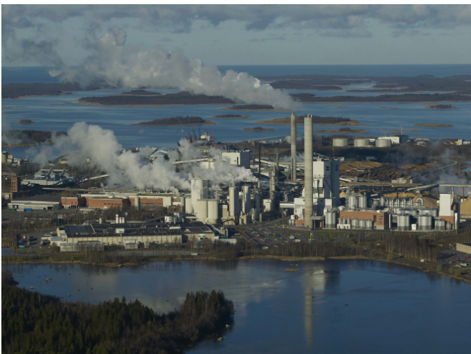
UPM Pietarsaari, Finland

Visy Paper, Australia APRIL, Kerinci, Indonesia and Ritzhao, China Stora Enso, Kvarnsveden, Sweden UPM, Pietarsaari, Finland APP; Gold East Paper, Dagang, China SCA, Ciudad Sahagun, Mexico Sappi Saiccor, South-Africa