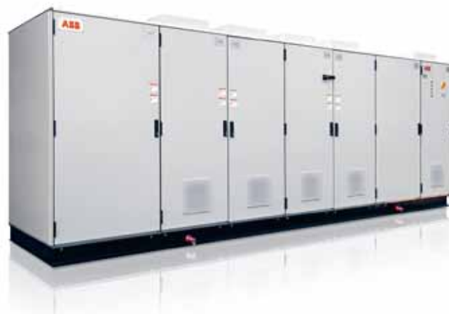
b ABB's PCS6000 static frequency converter

ship power connections: 11 or 6.6 kV as required by the ship.