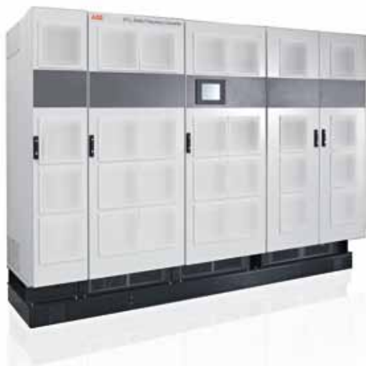
a ABB's PCS100 static frequency converter