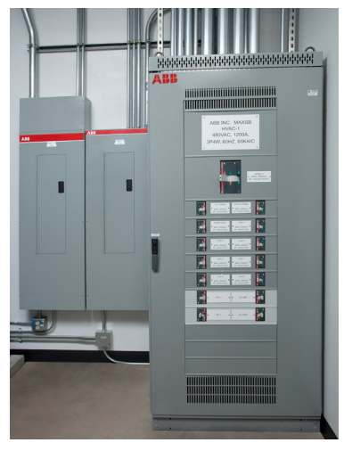
ABB ProLine Panelboard