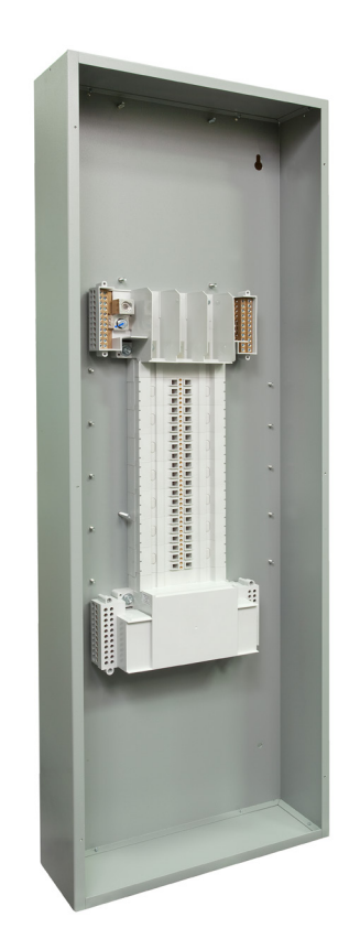
Nema 1 Enclosed Panelboard