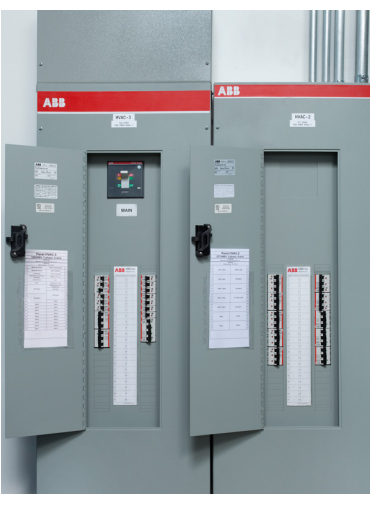
ProLine Panelboard installed in the VPP rated ABB, New Berlin facility

The ABB New Berlin facility is an example to manufacturing facilities worldwide that productive and efficient operations can go hand-in-hand with worker safety.