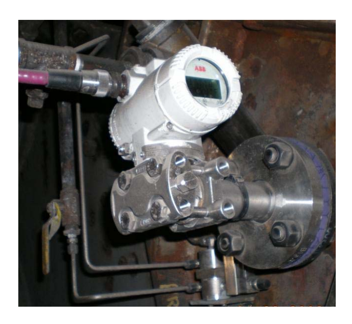
ABB 2600T pressure transmitter with direct-mount seal and Diaflex coated diaphragm. Transmitter is installed on the exhauster of a coal pulverizing mill.

A-P-Power_Diaflex_Coal_Pulverizing_A (9.21.10)