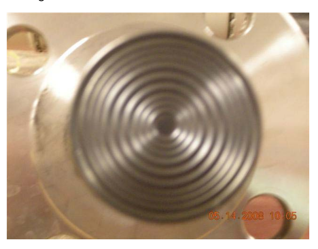
Inspection of diaphragm after eight months of service shows no adverse effects from the abrasive nature of fast flowing pulverized coal.

Diaflex-coated diaphragms have proved their durability in this application. Installations have resulted in significant savings in maintenance hours and more efficient burner management.