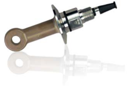
TB4043 is a sanitary electrodeless toroidal sensor. It meets the requirements of 3A approval with a seamless food-grade PEEK body and 2-inch tri-clamp flange.

ABB offers several models of specialized conductivity sensors for CIP applications. These sensors connect to the process via 2-inch (50mm) Tri-Clamp sanitary fittings. Each sensor model has a 2-inch flange that secures to the Tri-Clamp fitting. The sensor tip sticks into the process to be measured. ABB has 2- and 4-electrode conductivity CIP sensors, as well as toroidal units. Choosing the right CIP sensor depends on the conductivity range needed and the process chemical composition. Some examples include the conductivity sensors pictured below: