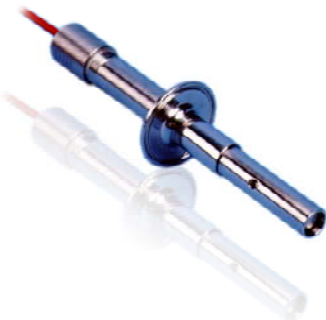
TB25 is a sterilizable 2-electrode stainless steel body conductivity sensor. It is often used on measuring rinse water conductivity.

Conductivity sensors used in CIP processes are characterized by a smooth surface finish to minimize the possibility of bacterial growth.