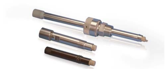
TB45 sensors have options for stainless and kynar bodies. These four electrode sensors have options for flush or extended tip mounting depending on the application requirements.